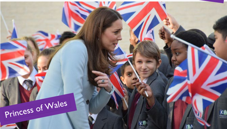
Princess of Wales