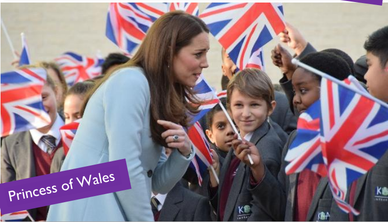
Princess of Wales